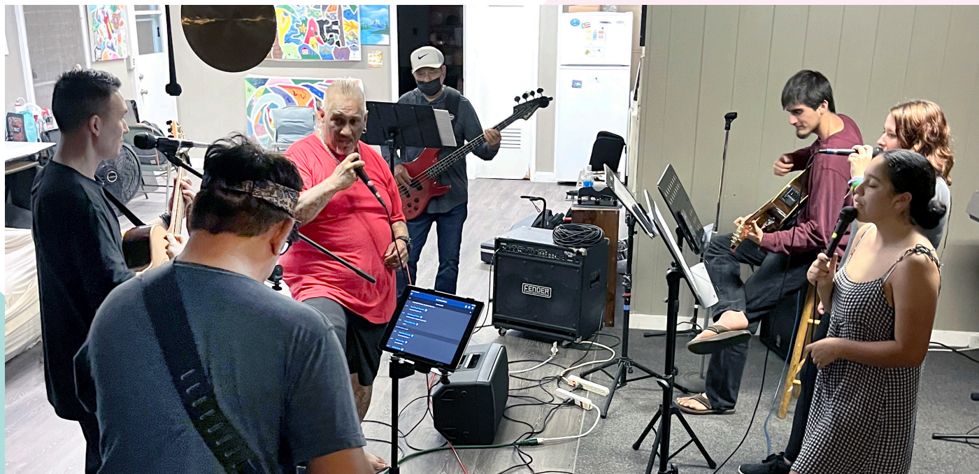
Ohana Church musicians practicing with BCM musicians on the new floors for an upcoming event on campus.