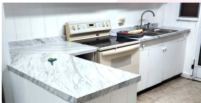
Renovated Hilo BCM Kitchen