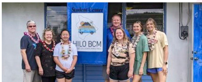
Mainland Mission Team

@HILOBCM | @HILOBCM | BCM.UHH@GMAIL.COM | 1409 KAPIOLANI ST. HILO, HI 96720