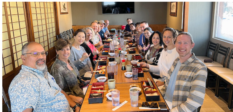
(above) HPBC Staff and Families Aloha Lunch