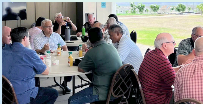
Pastors/Missions Leaders Gather at Valley Isle Fellowship on Maui