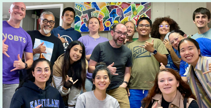
College Students Gather at BCM Hilo