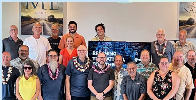
Pastors/Missions Leaders Gather at Kona Baptist, Hawaii Island

As part of the partnership, members of the International Mission Board (IMB) Mobilization Team met with pastors and missions leaders from 26 churches in Honolulu, Kona, Hilo, and Wailuku during the first week of October. Those gathered learned how Hawaii Pacific Baptists and be equipped to connect with IMB personnel on the field.