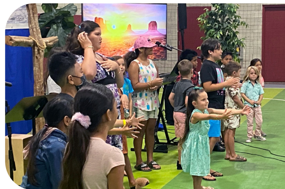
Kids performing Sunday morning, Ohana day.