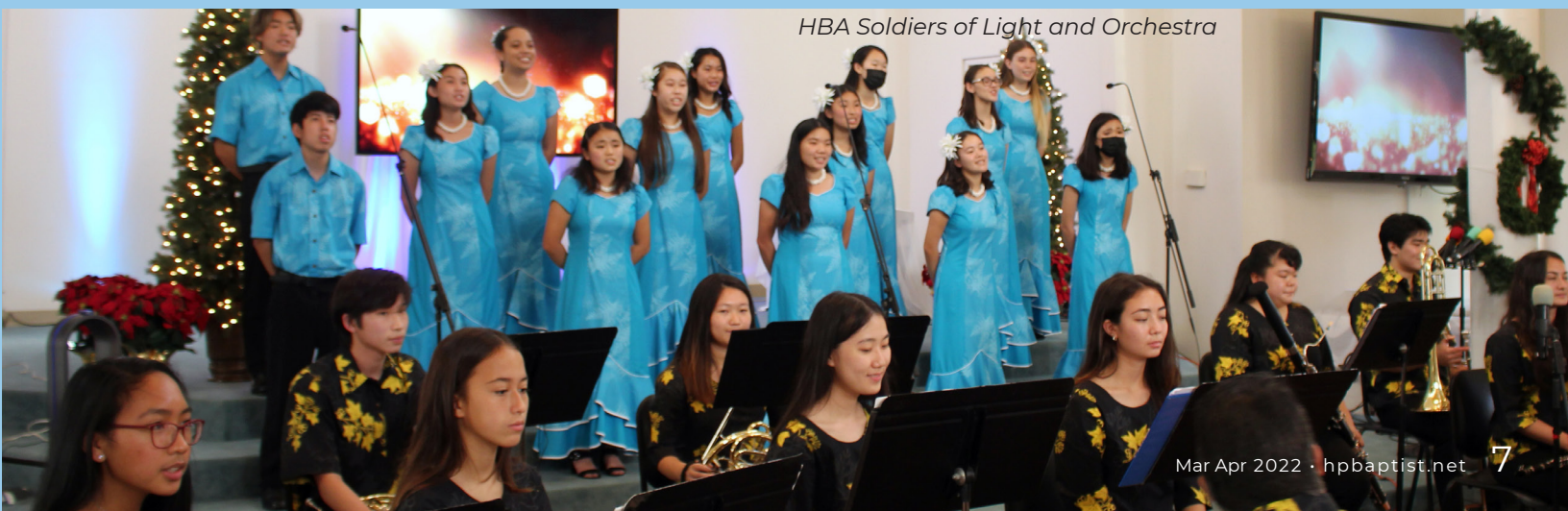
HBA Soldiers of Light and Orchestra

To learn more about opportunities to continue your theological education with Southwestern Seminary or any of our six Southern Baptist Seminaries, contact HPBC's Craig Webb at craig@hpbaptist.net .