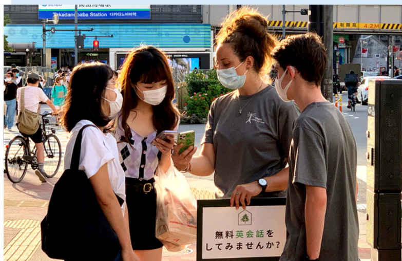
At Takadanobaba Station, we invited some new friends to our follow up event using a QR code on my phone.