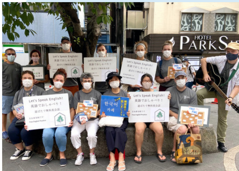
5 Minute English team at Ikebukuro Station