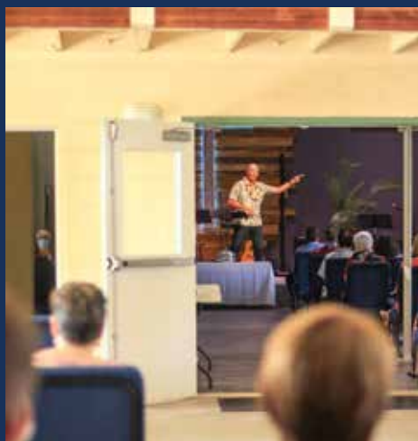
Because attendance at GracePoint's first Sunday was over capacity, seating was setup just outside the doors