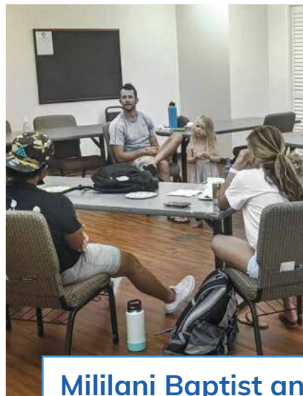
photo: prayer meeting to prepare for the outreach and training