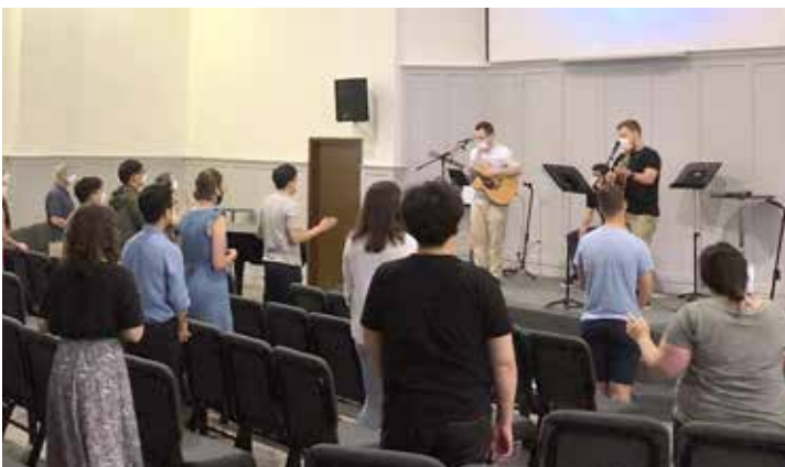
Freedom Village Church, Seoul