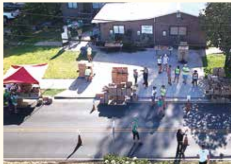
Aerial view of Food Distribution in early May 2020