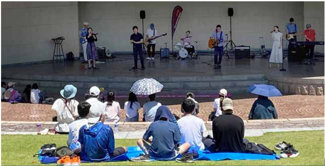
Himeji Baptist Church

After months of online-only worship, many Hawaii Pacific Baptist Churches have carefully returned to their places for gatherings for in-person worship.