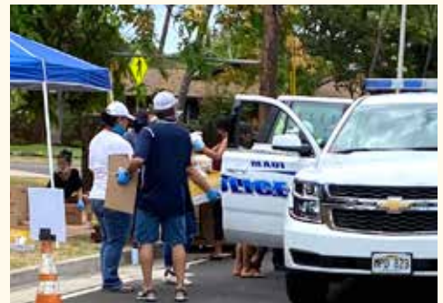
Each week the team loads 4 Maui Police Vehicles with 8-12 boxes of food for officers to deliver to families in need throughout west Maui

The Wednesday crew is building between 800 and 900 boxes a week