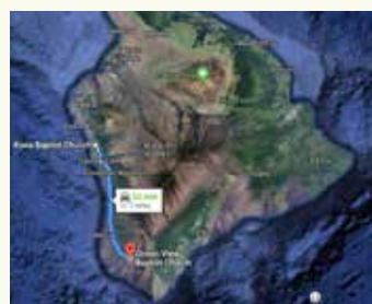
Map Showing Kona Baptist and Ocean View Baptist