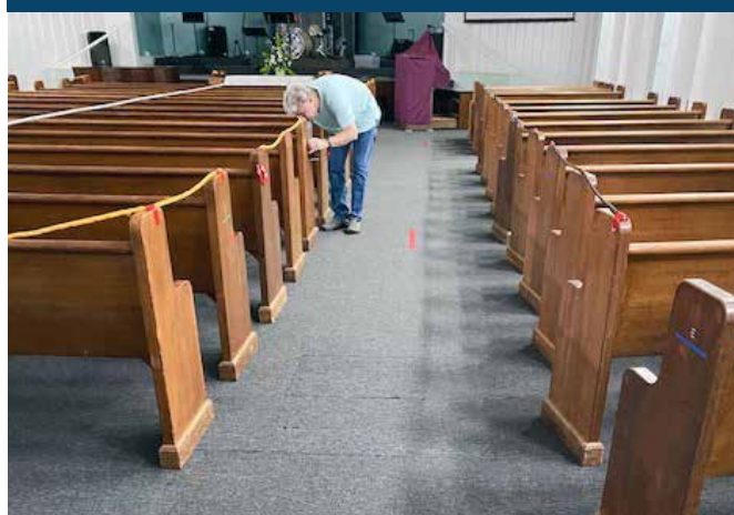
Before re-gathering officially, Kahului Baptist did a test run with a few members.