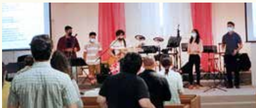
Guam Christian Life Fellowship Worship Service in the Calvary Baptist Church worship center

As congregations re-gather in their buildings, some have seen additional obstacles because they previously met in school facilities or had facilities too small to accommodate social distancing. The Gathering on Oahu and Guam Christian Life Fellowship (GCLF) on Guam have both found a place to re-gather with the help of sister churches in the area. Mililani Baptist Church enthusiastically opened its worship center for The Gathering to have Saturday worship services at 4 p.m. Calvary Baptist Church, Guam, welcomed Guam Christian Life Fellowship to their campus for Sunday evening services at 5 p.m.