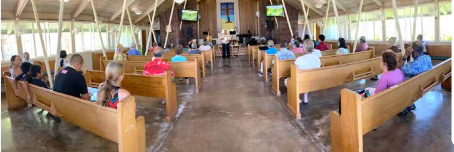
Kaunkakakai Baptist Church on the Island of Molokai re-gathered on Sunday, May 31, 2020