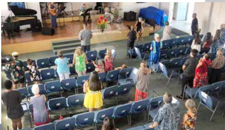
University Avenue Baptist Church