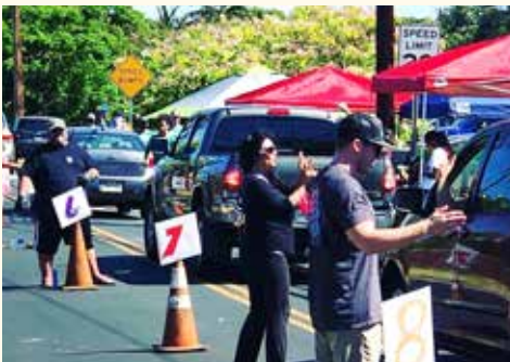
Serving 9 cars at a time — about 800 to 840 cars per distribution