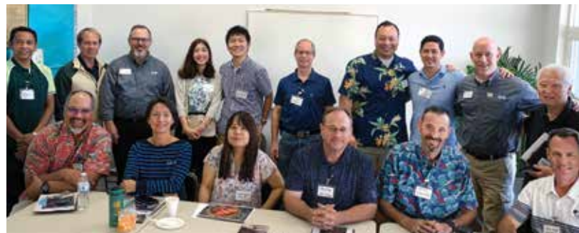
Some of the participants in the Pastors Track

Missions College One Day was co-sponsored by the International Mission Board and the Hawaii Pacific Baptist Convention and was supported by your church's gifts through the Cooperative Program.