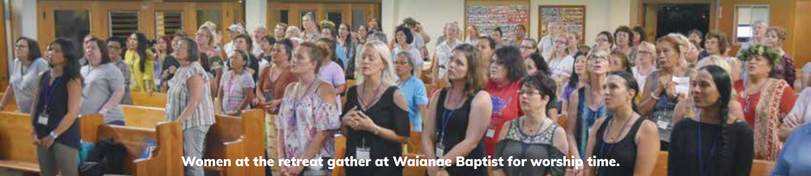
Women at the retreat gather at Waianae Baptist for worship time.