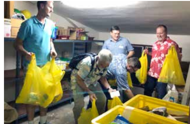
Preparing for the Refugee Detention Center

On the last day of the conference 15 of the attendees participated in Calvary Baptist's ministry to refugees in Bangkok with a visit to persons in the Refugee Detention Center.