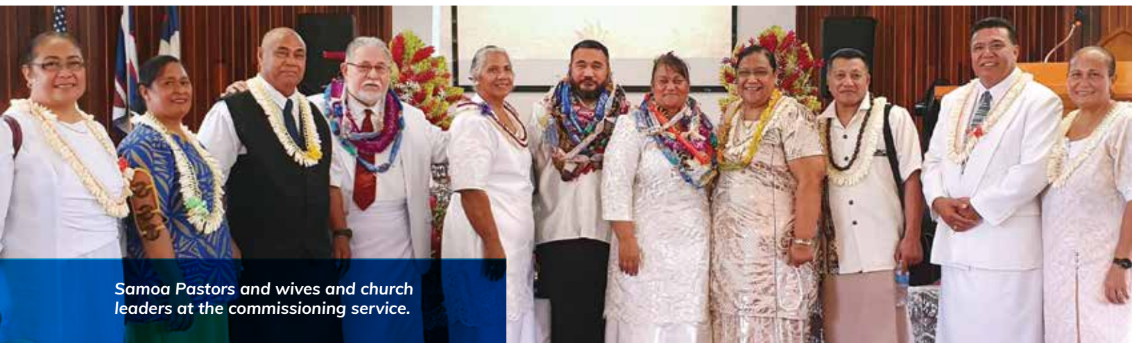
Samoa Pastors and wives and church leaders at the commissioning service.