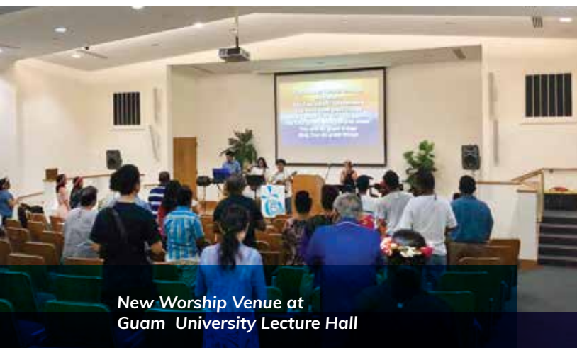
New Worship Venue at Guam University Lecture Hall