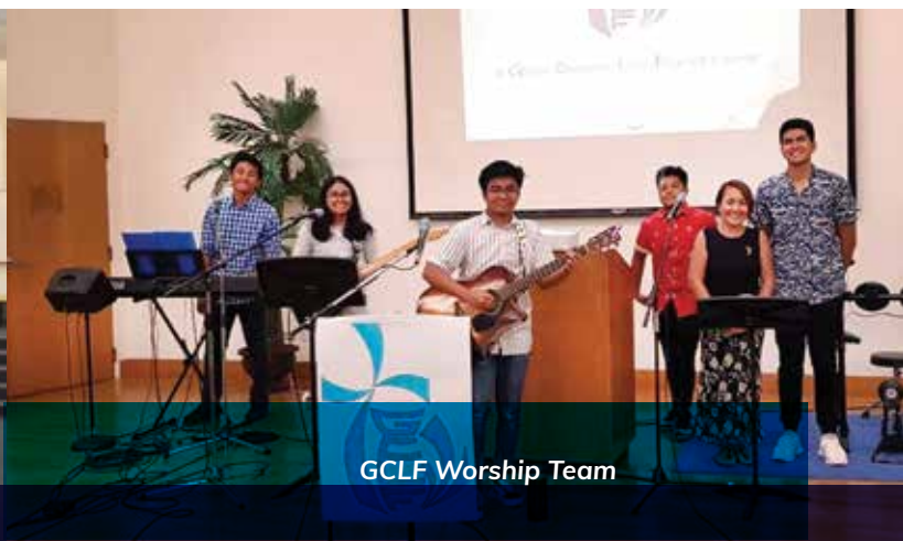
GCLF Worship Team