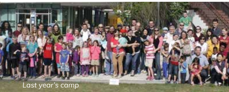
Last year's camp

It is with rest in mind that Songtan Central Baptist and Seoul International Baptist (along with other local English speaking congregations) will host their 4 th Annual Family Camp (August 29-31). The goal is to refresh and encourage families as they enter the new school year. The schedule has been designed to offer significant family time along with Gospel-centered training for marriages and parenting.