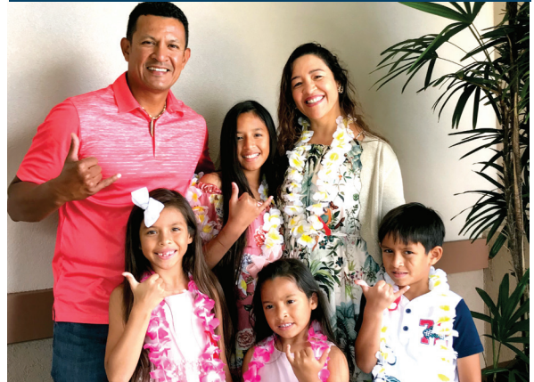
One of the families who recently became members of Makakilo Baptist