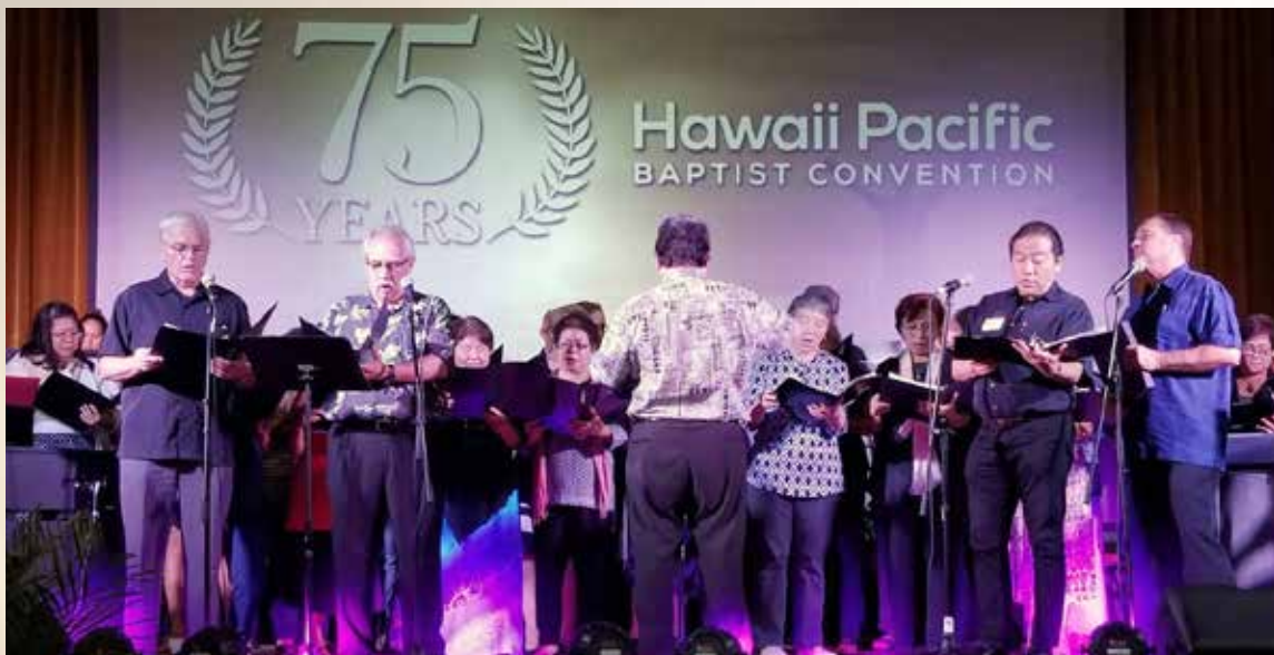
Multi-Church Choir singing "The Hallelujah Chorus"