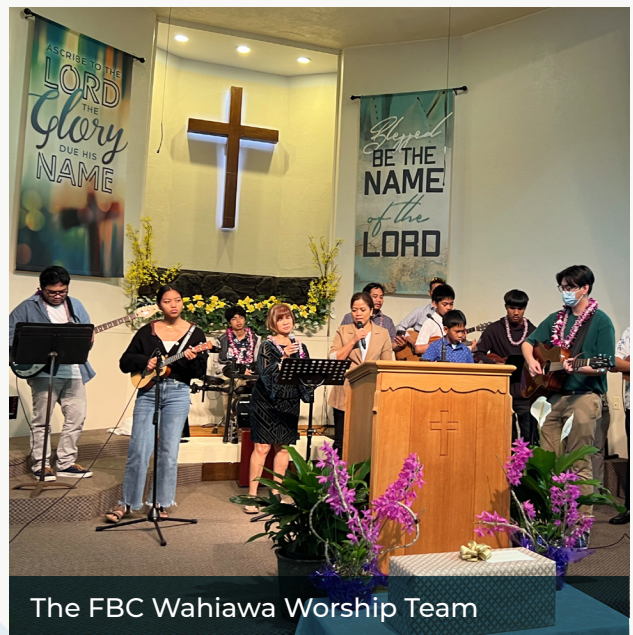
The FBC Wahiawa Worship Team