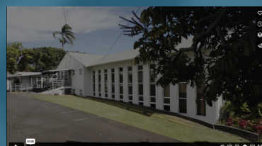
Creative Community Outreach, Journey Through Jerusalem