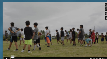
Outreach Football Camp Hamama Community Church